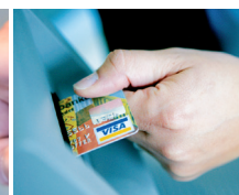
Choose between different card readers (option).